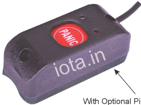
With Optional Pipe Mounting