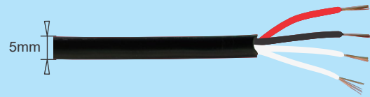
Special Automotive Cable With 4 Numbers 0.5 Sq mm Wire FLY-B

Standard Wire Length Is 1 Meter, We Shall Provide Wire / Pigtails As Per OEM's & ODM's Requirement