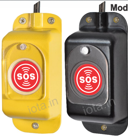
Model No. CRCA Panic Switch iota709